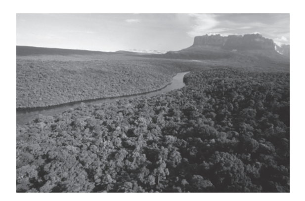
Fig. 6.1 shows an area before deforestation and after the planting of soya. Occasionally small areas of forest are left if the land cannot support agriculture.

In South America, forests have been cut down to provide land for cattle grazing and for growing crops, such as soya beans.